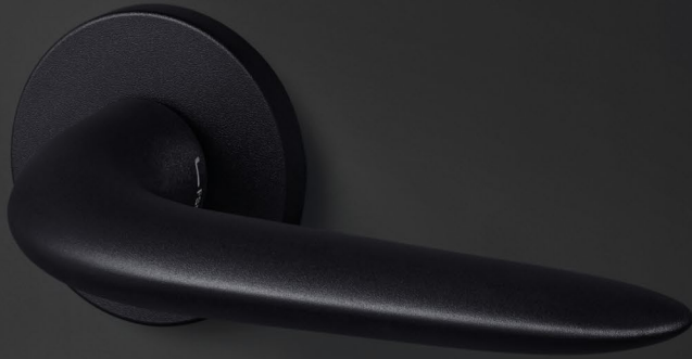
Cover: Lever 1271 in Stainless Steel (6204) Above: Lever 1285 in Aluminum (0810) Back Cover: Lever 1242 in Stainless Steel (6204)